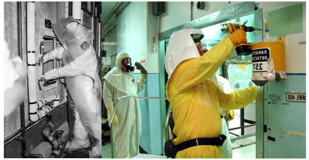
Department of Energy, Hanford Site

There are approximately 600,000 former workers believed to have worked within the DOE complex, or for its predecessor Agencies, during the past 60-plus years, who are eligible to participate in the program.