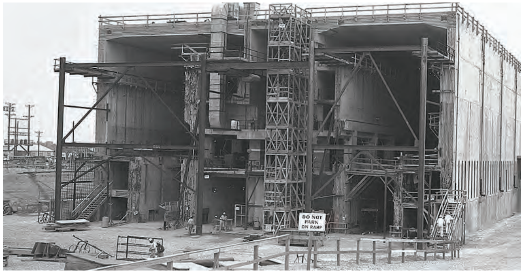
Department of Energy, Savannah River Site - H Canyon circa 1950s Under Construction