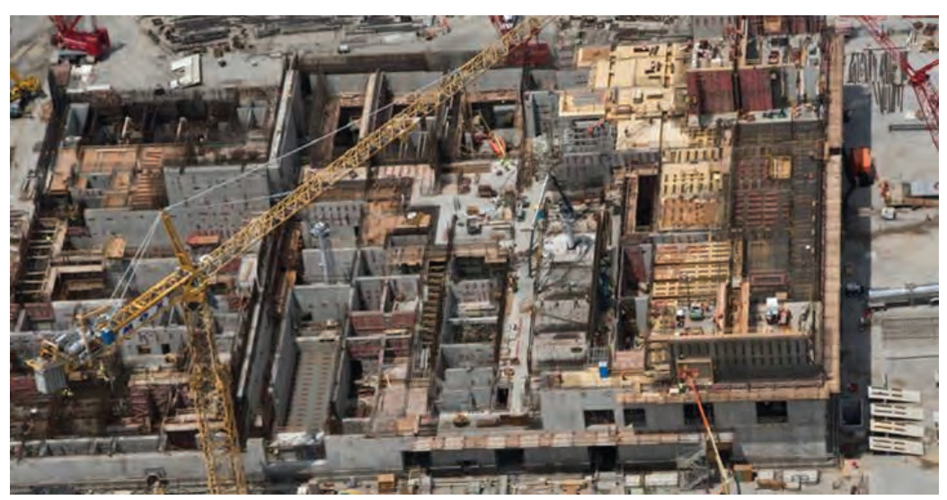
Department of Energy, Savannah River Site - Mixed Oxide Fuel Fabrication Facility Under Construction

If you do not have access to a computer, a copy can be requested by calling (202) 586-2407.