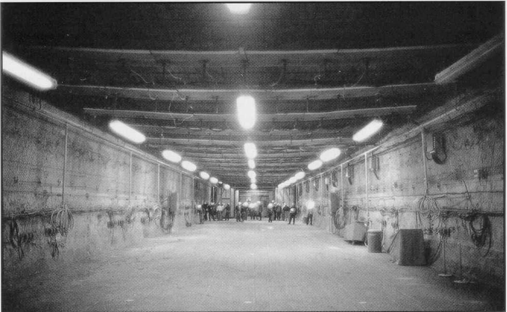
This underground waste-disposal room , excavated in 1986, was the first of 56 chambers to be excavated at the WIPP. It is 300 feet long, 33 feet wide, and 13 feet tall and could hold six thousand 55-gallon drums of transuranic waste. It lies 2,150 feet below the surface of the earth. Room 1 of Panel 1, Waste Isolation Pilot Plant, near Carlsbad, New Mexico. February 25, 1994.