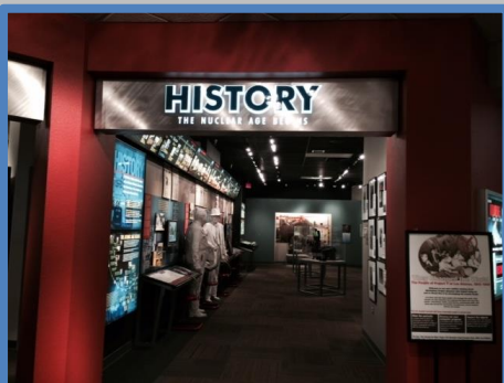
History, The Nuclear Age Begins

The museum is broken into six specific sections; Lobby, Auditorium, Theater, Defense, Research, and History.