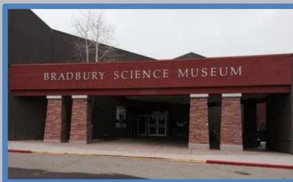
Bradbury Science Museum

This museum does a great job with displaying not only our historical accomplishments, but also the ongoing science and research missions of the Los Alamos National Laboratory (LANL). As always, I migrated to the History section of the museum and much like the American Museum of Science and Energy highlighted in our last edition, there are many artifacts from the establishment of the laboratory in 1943.